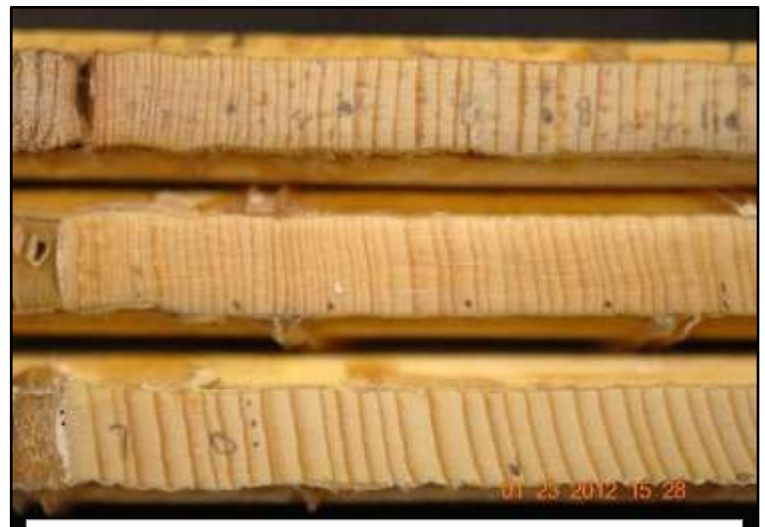
Fig. 2. Examples of three mounted tree cores from the Spring Mountains. The bottom core is a white fir core from nloop1 plot, center core is ponderosa pine from nloop1 plot, and the top core is a ponderosa pine from w2 plot near Whispering Springs.