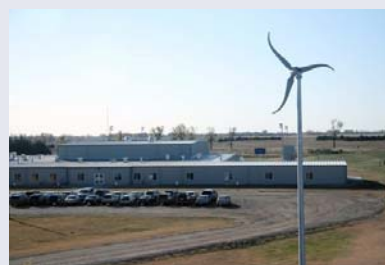
Wind for Schools system installed at Sanborn Central School in Forestburg, South Dakota. PIX16032/ East River Electric Power Cooperative.