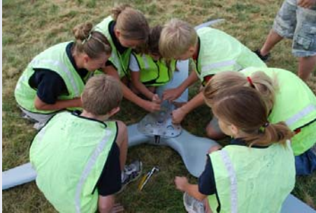
Students at Idaho's Pocatello Community Charter School participated in a Wind for Schools project.

As the United States dramatically expands wind energy deployment, the industry is challenged with developing a skilled workforce and addressing public resistance. Wind Powering America's Wind for Schools project addresses these issues by: