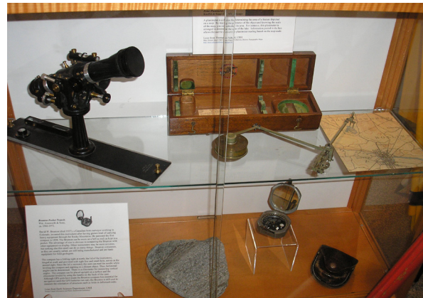
Figure 2: More of formal exhibit, Dimond Library