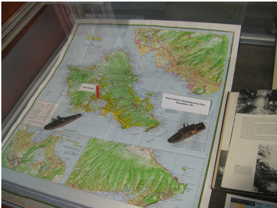
Figure 3: Casual display on Pearl Harbor