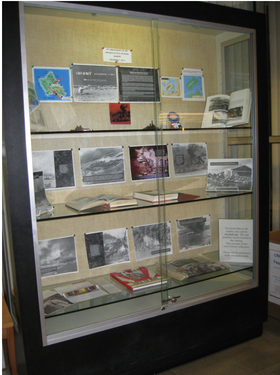
Figure 12: Pearl Harbor 70th anniversary exhibit

An anniversary could be the subject of a display. 2011 through 2015 is the sesquicentennial of Civil War battles, so a person could have a display with maps of battles from the Civil War year being commemorated. I did a display for the seventieth anniversary of the attack on Pearl Harbor (see figure 12). A person could do an exhibit for a state, county, or city centennial or sesquicentennial by displaying maps from the history of that area.