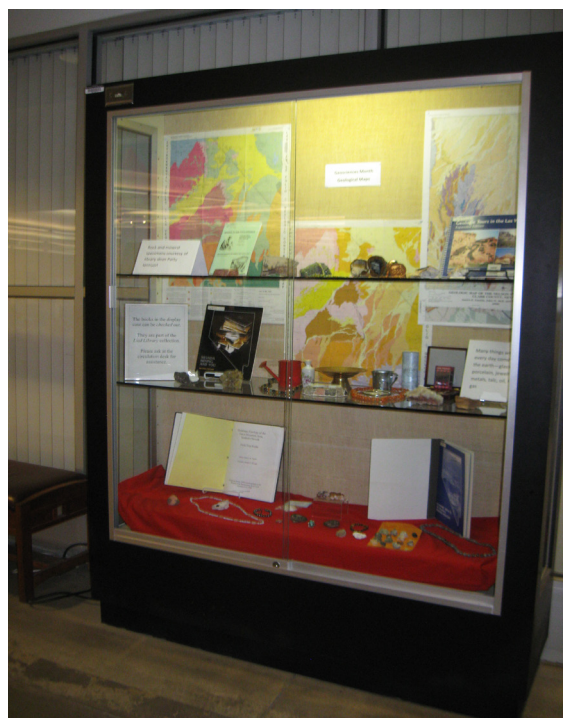
Figure 5: Exhibit in vertical case: geological maps