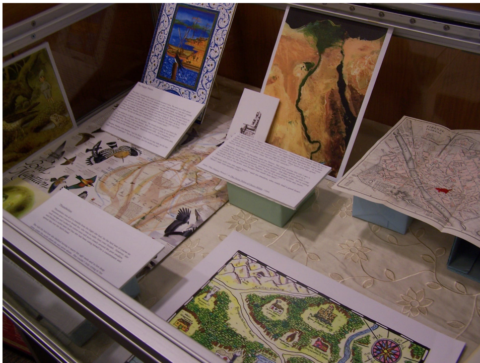
Figure 7: Use of fabric to line wooden case

Frames and exhibit cases made out of wood and mat board not made for preservation have acid and lignins in them that can damage the maps. Plywood and other composite materials that exhibit cases are often made from can also give off harmful gases. There is acid-free and lignin-free mat board, and again maps can be encapsulated. Wood can be sealed with moisture-borne polyurethanes or two-part epoxy sealants. Wooden cases can be lined with something such as Mylar, polyethylene foam sheeting, or acid-free ragboard. Fabrics such as silk are acidic, and wool gives off sulphur compounds. Better fabrics to line cases with would be undyed cotton, linen, polyester, and cotton-polyester blends. Fabric should be washed to remove sizing, and if dyed fabric is used it should be washed until no dye comes out in the water (see figure 7 for fabric being used in a case). Acid-free ragboard can be used to both protect maps from harmful materials and to support them.