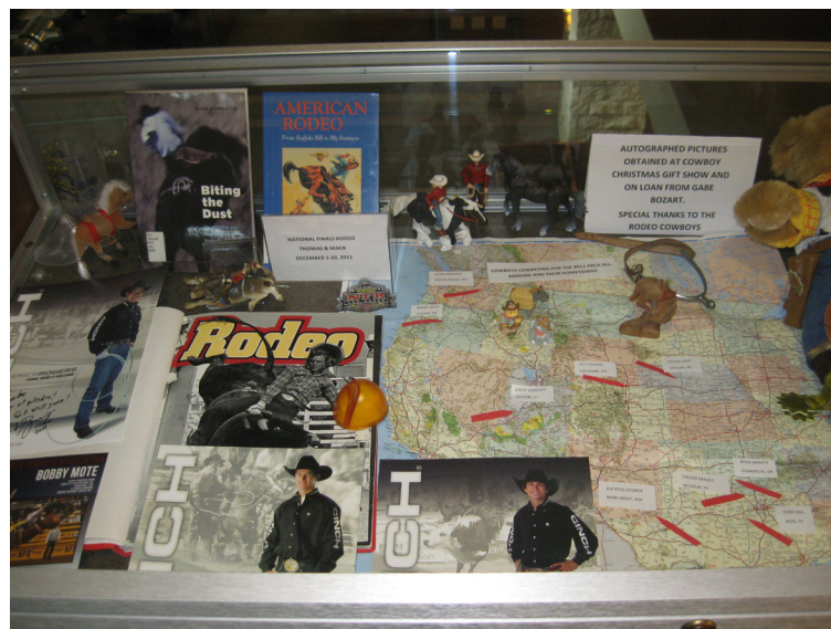
Figure 13: Event as exhibit theme: National Finals Rodeo

Other special events could be the focus of a display. This year the summer Olympics will be held in London. Actually there are Olympic events all over England, and there are maps showing the different venues on the web, and there are also maps of the venues in London. Muriel Strickland suggested a vacation in Europe as a display subject. A person could mark the cities most often visited by tourists. Exhibits can be centered on other sports events. I showed where the elite eight teams in the NCAA basketball tournament were from. For the National Finals Rodeo, which is held in Las Vegas, I labeled the towns the cowboys competing for all-around cowboy were from (see figure 13).