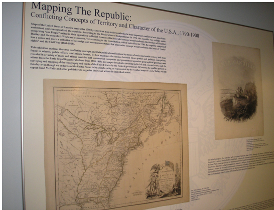
Figure 1: Formal exhibit, Dimond Library, University of New Hampshire

related to the Map Library.” She talks in her article about more casual displays of maps, usually on the walls or the tops or sides of map cases in the map library. I am going to talk about both map displays and exhibits. Most of the map exhibits I do are in glass cases, but they are still fairly casual with a few simple captions printed out on my computer, maps simply laid in the cases or thumbtacked to the back of the case, and done with little research. Here are pictures of a formal exhibit at the Dimond Library at the University of New Hampshire (Figures 1-2) and of a casual exhibit in my library (Figure 3).