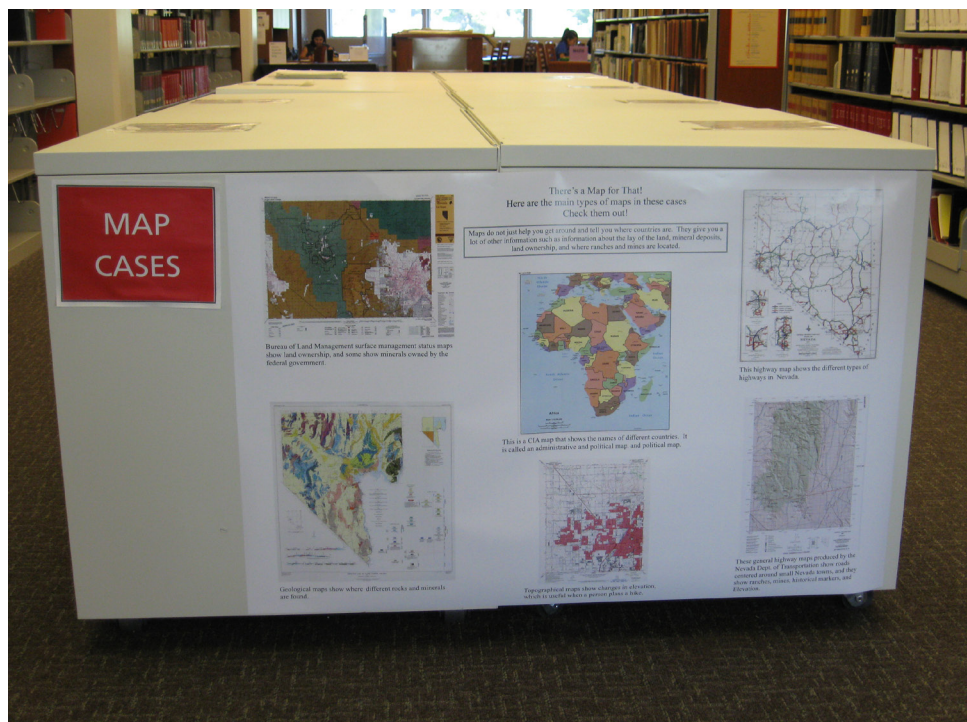
Figure 8: Map types poster

Temporary displays can show the different kinds of maps in the map collection such as topos, census maps, Bureau of Land Management (BLM) maps, geologic maps, road maps, cadastral maps, and National Geographic Society maps. Map dealers have posters showing different types of maps. Someone suggested I make a poster about the different kinds of maps we own. I did that by having someone scan maps, and then I put the scanned images together with labels for the different kinds of maps and little blurbs about them in Microsoft Publisher (see figure 8). We have a service in the library to print posters on a large-format printer, so I had the poster printed, and I attached it to the ends of our map cabinets with heavy-duty double-sided tape as it was too heavy for magnets to hold it.