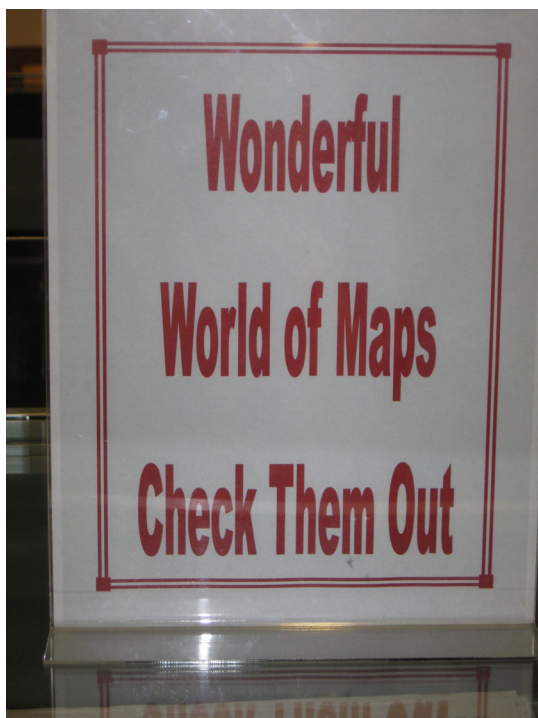
Figure 4: Sign for map exhibit case

Muriel Strickland says in her article that map displays (or exhibits) are “to catch the attention; to lead people to or further into the Map Room and a realization of what a map library might be able to do for them.” I also want to tell students that they can check out the maps, so for that reason and to call attention to the exhibits I have in a small horizontal case, I have a sign on top of the case that says “Wonderful world of maps. Check them out.” (See figure 4) I also sometimes have exhibits in a vertical case on the first floor of the library (figure 5). If a person’s map collection is off the beaten path, it may be better to have exhibits in higher traffic areas.