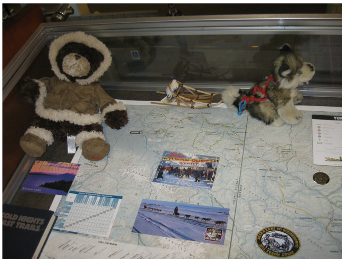
Figure 14: Yukon Quest exhibit

Other things besides maps such as books from the stacks on the topic of an exhibit or three-dimensional objects can be included in exhibits. The Japanese earthquake exhibit included newspaper clippings, a sake set, a cup and saucer from Japan with Mt. Fuji on them, and a couple of Japanese dolls. The Egyptian uprising exhibit had bookmarks that were made to look like papyrus with hieroglyphics on them. One display involved a world map and currency and small objects from different countries. Besides pictures of the attack from the National World War II Museum, the Pearl Harbor exhibit had a “Remember Pearl Harbor” replica button and some metal miniature World War II-era battleships. A collection of dolls wearing the native costumes of different countries were matched with the small CIA maps of the countries they represent. The Final Four NCAA basketball exhibit had a teddy bear in a basketball uniform, a tiny basketball, and newspaper articles on the championship. The display on geological maps included rock and mineral specimens and things made from rocks and minerals such as talc, gemstone jewelry, and metal objects. The current display on the Yukon Quest dog sled race includes the official map of the route of the race, a book on sled dog racing, the race poster, a teddy bear in a parka, and a tiny wooden sled with an Inuit doll musher pulled by a stuffed sled dog pup in harness (see figure 14).