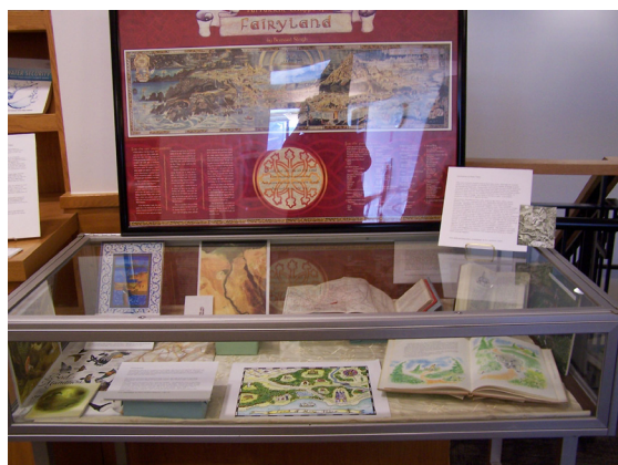
Figure 10: Fairy tales formal exhibit

Displays can center on an environmental topic such as where hurricanes occurred in one year. A map display could center on a feature such as maps of islands. Map displays could be done for a cultural feature like national parks and monuments. Another possible theme is maps in literature (see figures 10-11 for an exhibit on maps in fairy tales)