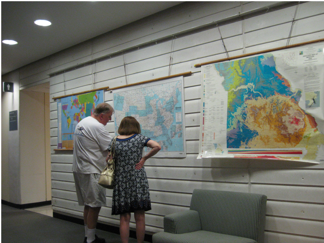
Figure 6: Maps hanging from picture rail at Southern Missouri University

If the maps are expendable because they are duplicates or superseded or are copies, they can be taped to map cases, which are usually smoother than walls and therefore easier to get tape to stick to, plus there is less of a chance of the tape pulling paint off a cabinet. Expendable maps or copies of maps can be thumbtacked to bulletin boards. If a person does not want to make holes in the map, it is possible to hold it with a row of thumbtacks put along the edge of the map. Maps can also be hung from a picture rail with clips (see figure 6 for a map display hanging from a picture rail at Southern Missouri University in Springfield, Missouri).