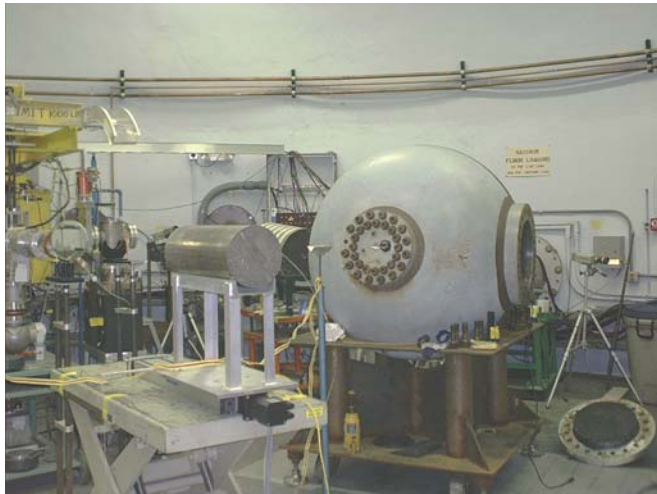
Experimental facility at LANSCE, Los Alamos, NM.

Analysis of linearization characteristics on a Beowulf cluster was completed. They are now working on characteristics of the Supercomputing Center and the linearization of criticality studies.