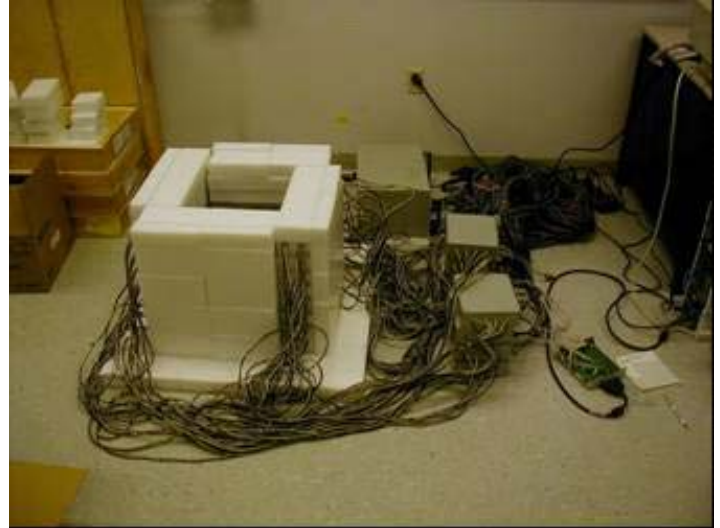
Neutron Multiplicity Detector System configured in a cubic geometry for background and source counting.