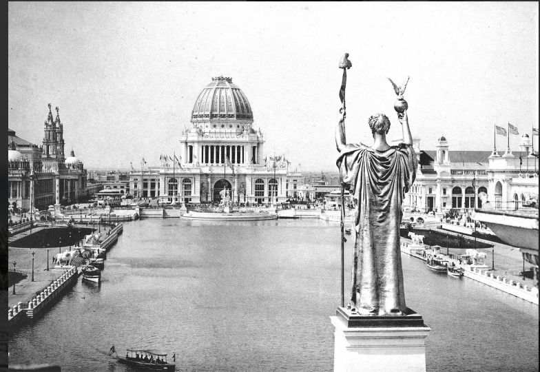
H.D Higinbotham, Official Views of the World's Columbian Exposition . (Chicago: 1893).

Methodology: Previous literature review of the most heavily cited and influential studies on the City Beautiful movement and Daniel Burnham's significance in the movement