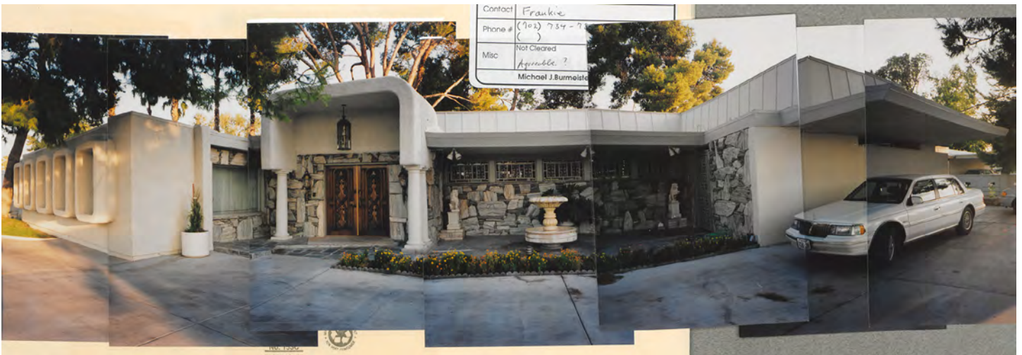
363 E Desert Inn Road, August 19, 1994 (home of Frankie Perasovich)