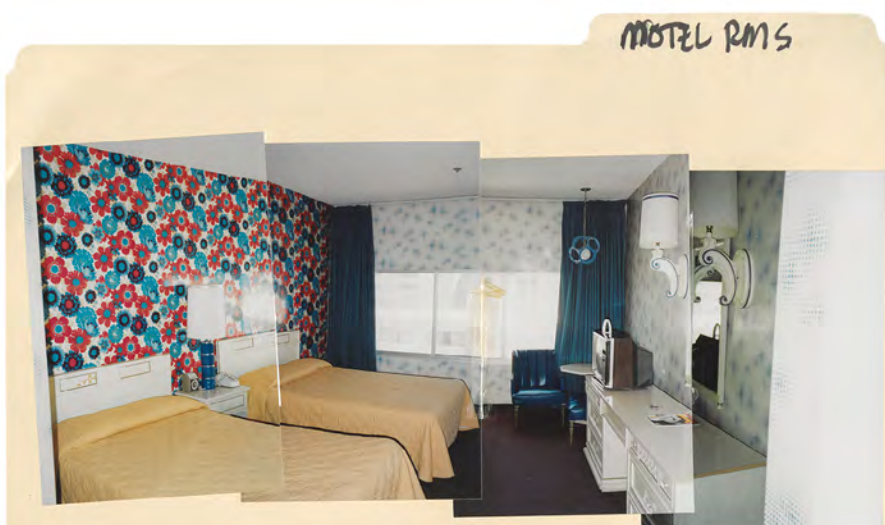
Guest room in the El Morocco, Hotel, summer 1994 (2955 Las Vegas Blvd South)