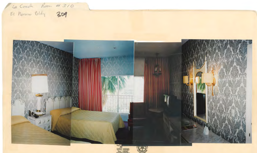
Guest room in the La Concha Motel, summer 1994 (2955 Las Vegas Blvd South)