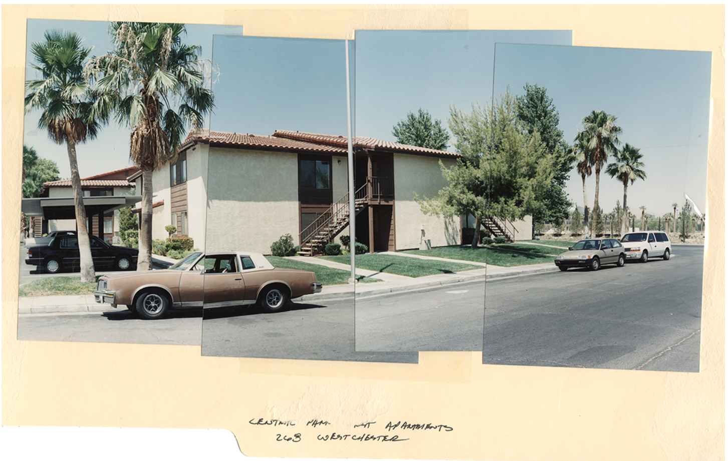
Exterior apartment building east of the Las Vegas Strip, 1994

The collection consists of a great deal, possibly all, of the location scouting research materials for the motion picture Casino (a film by Martin Scorsese released in 1995 by Universal Pictures.) Color photos taped together to create panoramic landscapes illustrate locations that were considered for shots and scenes in the film including the places where the actual events took place as described in Nick Pileggi's true crime novel 4 though more often than not these were rejected as locations for the scenes. Roughly two-thousand images, most comprised