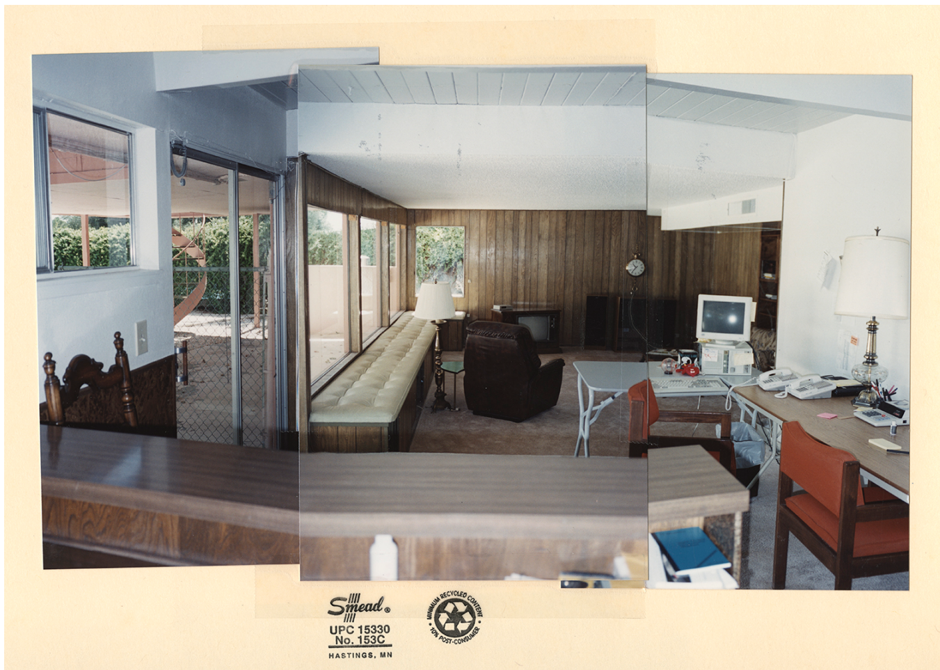
Interior of 2058 Ottawa Drive, August 22, 1994

Like the film which chronicles a significant shift in the narrative of Las Vegas from mob to corporate control and pervasive skimming to leveraging, these pictures also record a fundamental shift in most Americans daily life since 1994 – a subtle shift from actual to virtual in this glimpse of pre-digital lives. We see plenty of the old cathode ray tube televisions, wired phones and just a few bulky desktop computers but no evidence of the wireless digital devices so pervasive to daily life today. Not a single cellphone or laptop is pictured let alone any tablet devices or smart appliances as these were not available in the mid-90s.