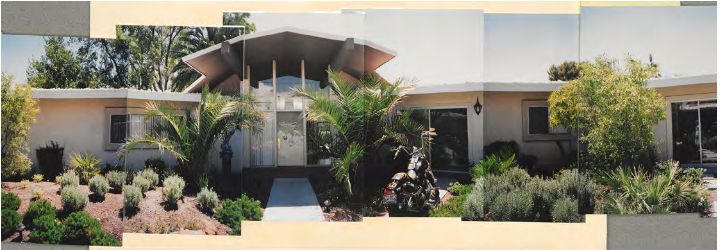
359 E Desert Inn Road, August 15, 1994 (home of Vladimir Kekhaial)