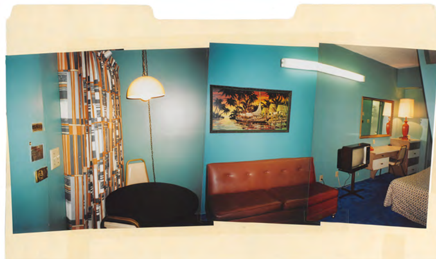
Guest room in the Glass Pool Inn, summer 1994 (4613 Las Vegas Blvd South)