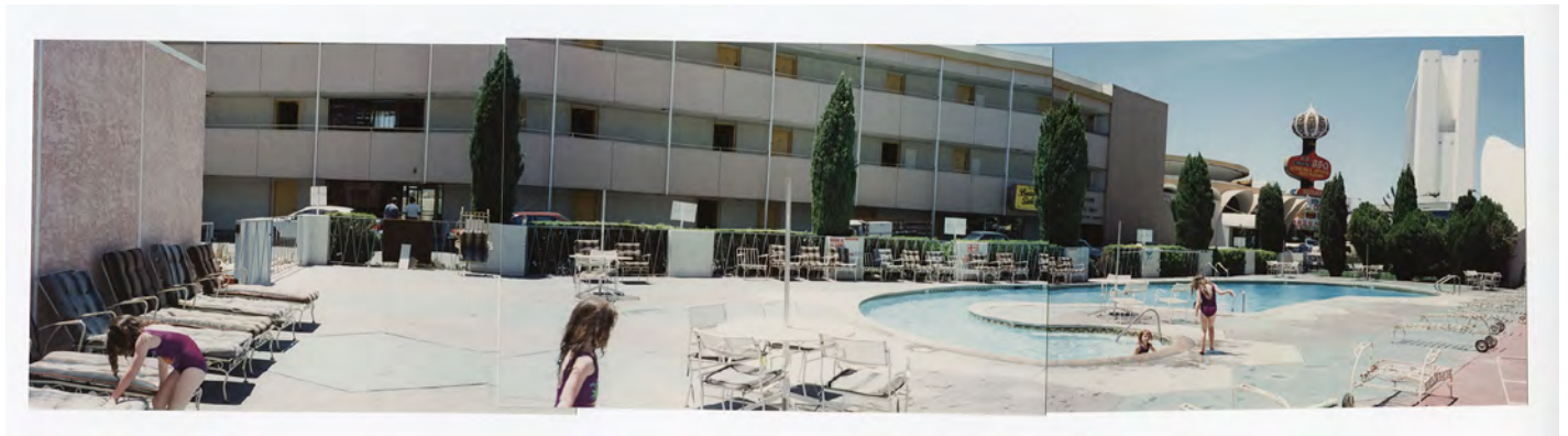
Riviera pool, summer 1994.

culture in transition. Through photo and video projects, my work often depicts architectural ghosts operating as conceptual memento mori . 3 This is certainly what I have found in the Mancuso collection and why I wanted to work with it. I am re-recording edited selections of the materials in the Mancuso collection to make them more visible and to re-contextualize their use and value. I am interested in the images in relation to three areas of concern – as archive; as appropriation art inside out; and as a conduit to consider copyright law.