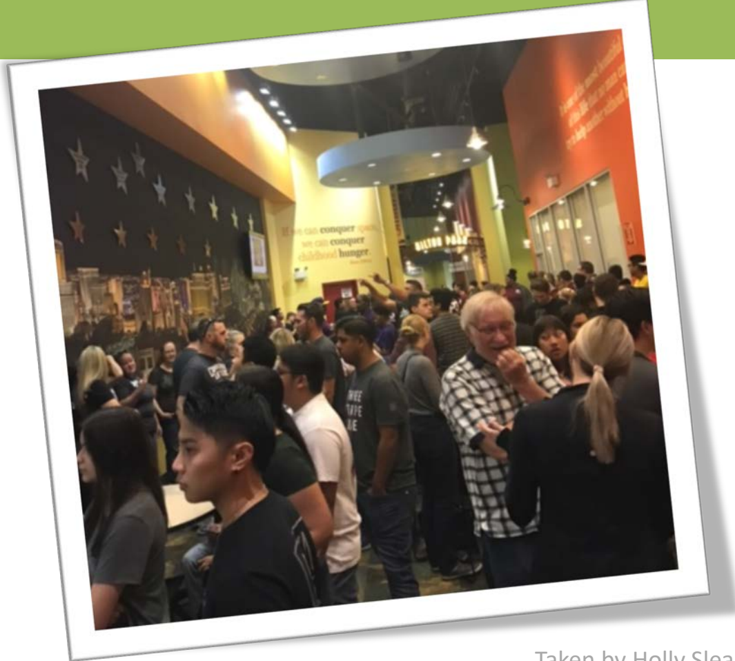
Taken by Holly Slear at Three Square

Three Square is dedicated to eradicating food insecurity through food rescue and food bank programs.