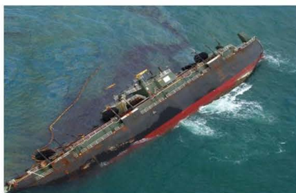
(ENTRIX Inc., 2015)