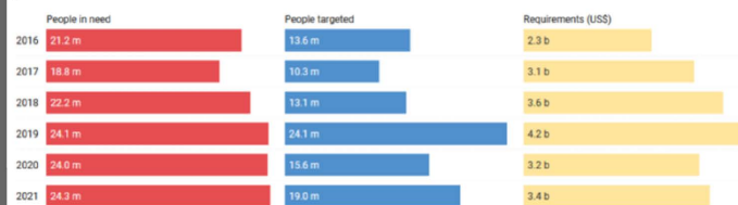
Chart: DDI1A - Get the data