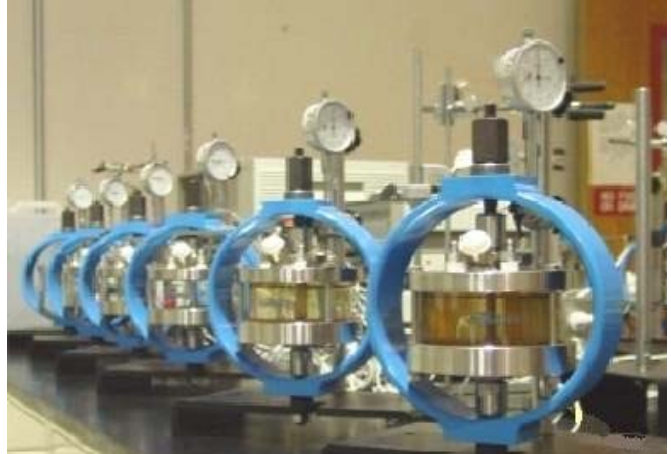
Constant load test setup.

The notched specimens were used to increase the severity of cracking. The cracking susceptibility under a constant loading condition can be characterized either by the time-to-failure (TTF) or a threshold stress for SCC, below which no cracking occurs. For SSR testing, the cracking behavior was evaluated in terms of the ductility parameters such as percent elongation, percent reduction in area, and the true fracture stress obtained from the stress-strain diagram.