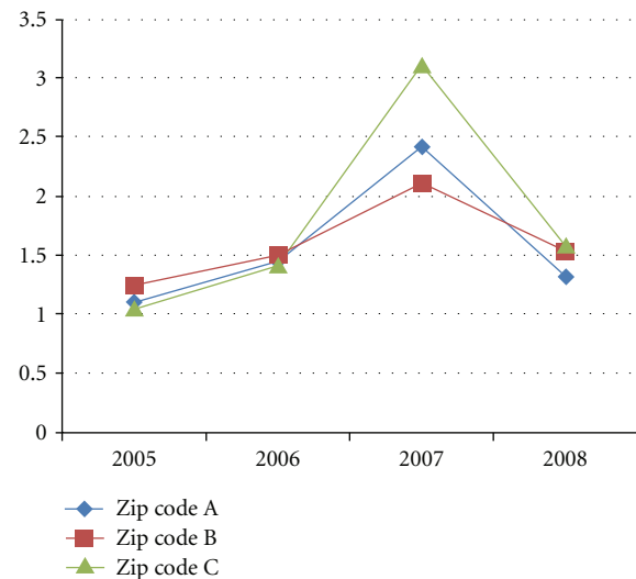
FIGURE 2: Bipolar/depressive disorder discharge diagnosis percent of total selected diagnoses by zip code.

The sharp rise in all zip codes for bipolar and depressive disorders in 2007 coincides with the doubling of foreclosure filings nationally and an increase in unemployment in the Las Vegas-Paradise MSA, consistent with the expected rise in mental health disorders associated with stress. This is consistent with the findings of a 2009 survey of 388 residents