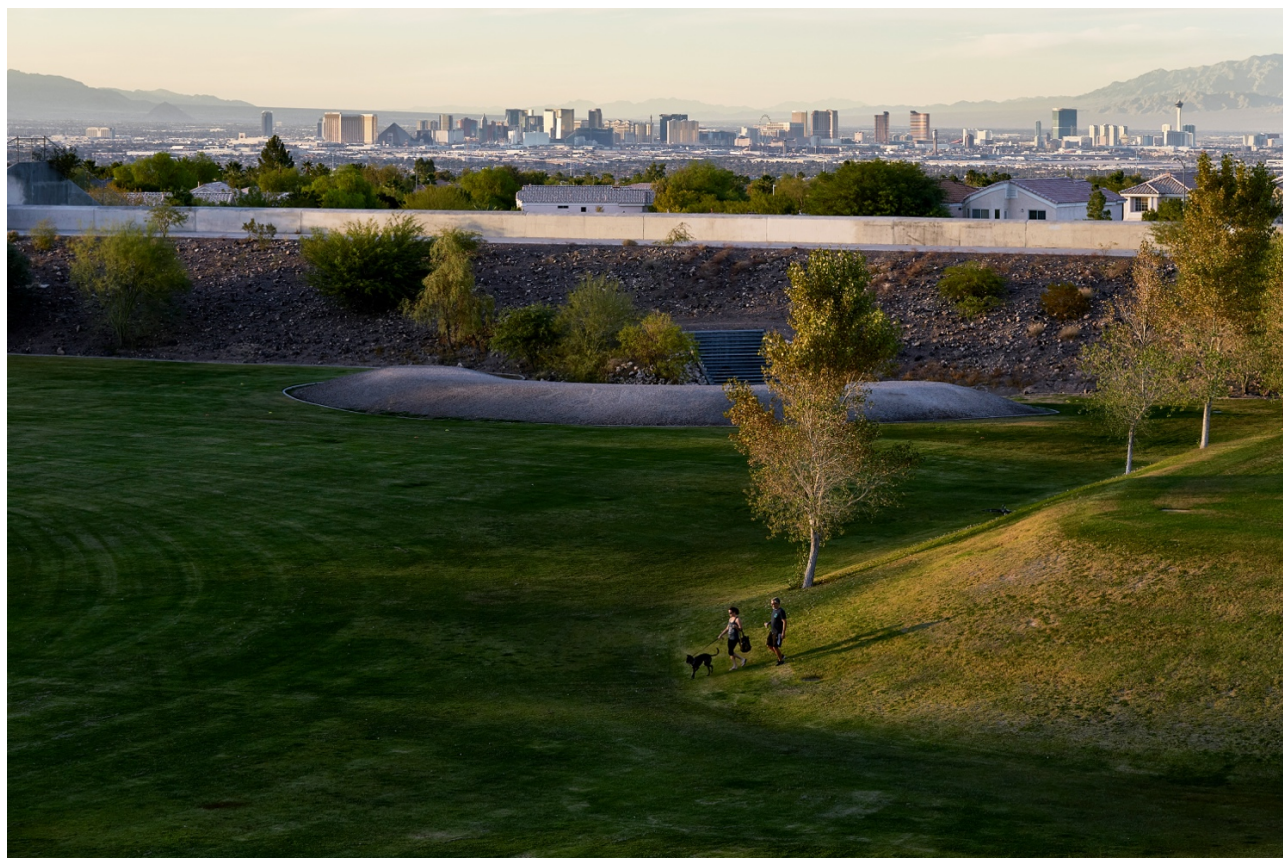
Anthem Hills Park detention basin with the Las Vegas Strip, looking north, Henderson, NV. UNLV University Libraries Photographs of the Development of Las Vegas Valley, Nevada.