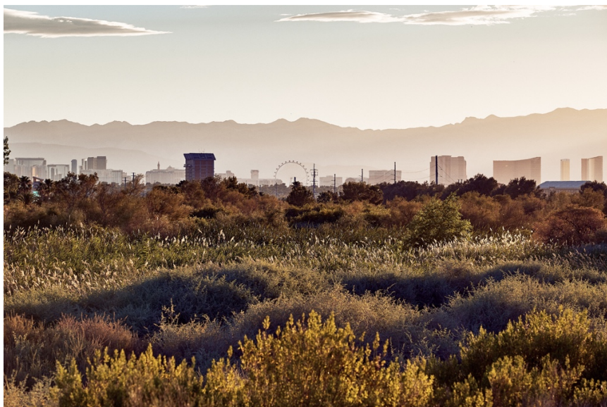
Vegetation growing in the Clark County Wetlands Park with the Las Vegas Strip in the background. UNLV University Libraries Photographs of the Development of Las Vegas Valley, Nevada.