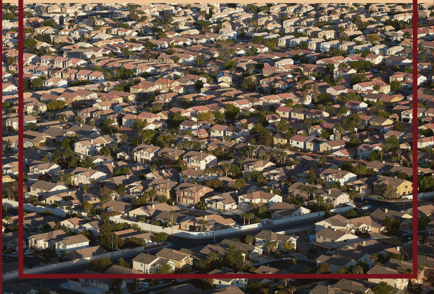
Single family home development below Lone Mountain, Las Vegas, Nevada. UNLV University Libraries Photographs of the Development of Las Vegas Valley, Nevada.

Friday, November 9, 2018 | 10:00 - 11:30am Greenspun Hall Auditorium