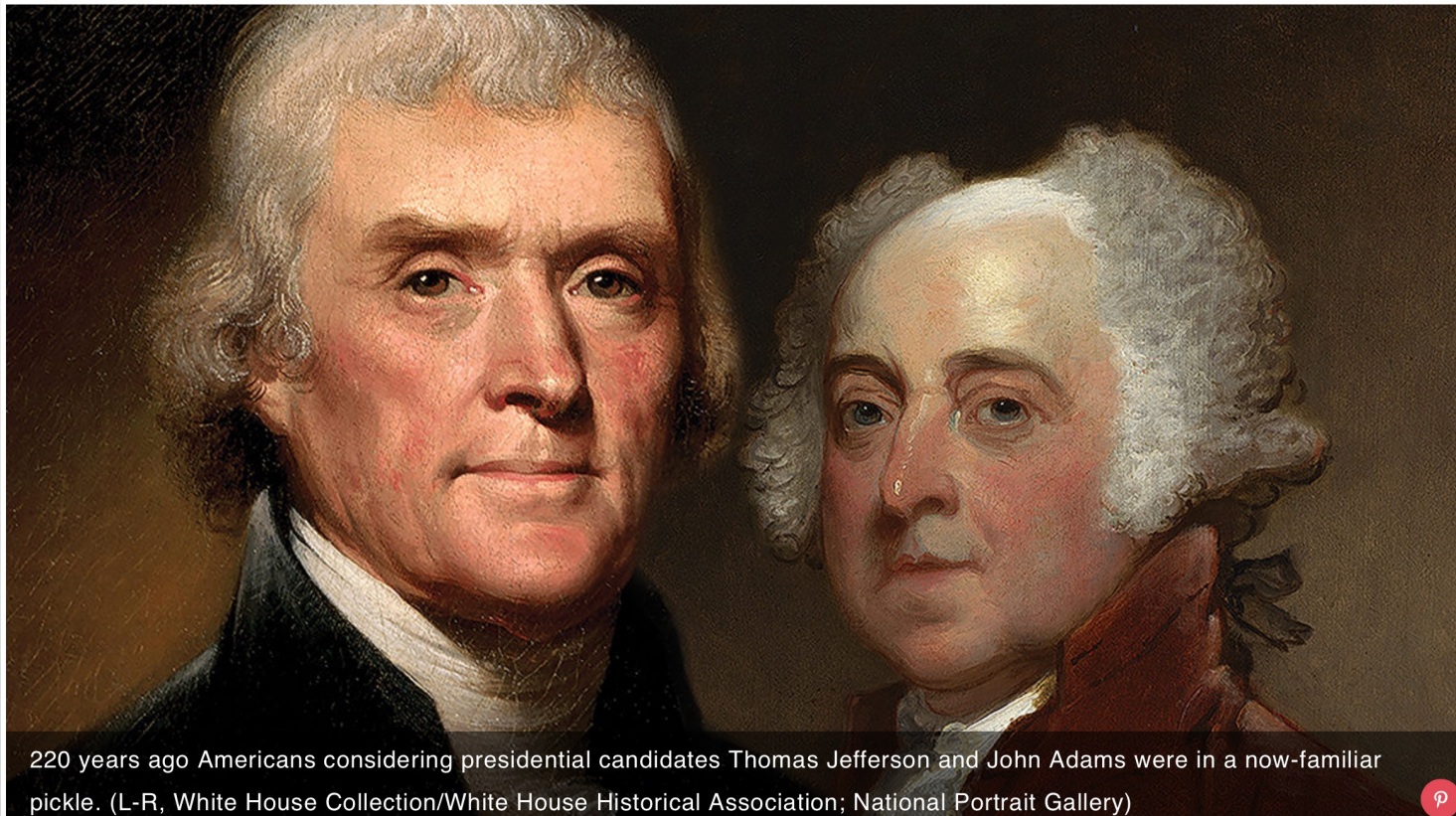
220 years ago Americans considering presidential candidates Thomas Jefferson and John Adams were in a now-familiar pickle.