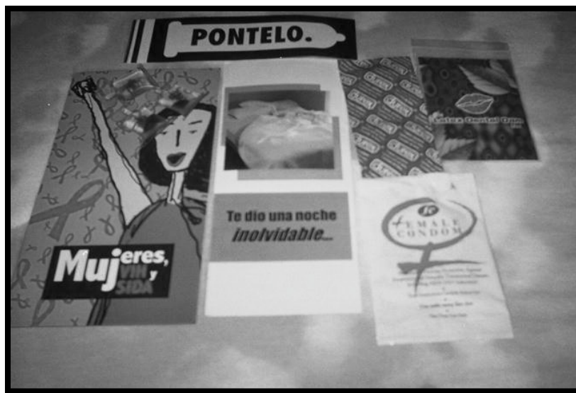
Figure 1: Participant photos reflecting the fear and concern about immigration policy

“Well, I think many people are just like what you see in the photo, there they are. Brochures are just there, condoms are just there, information if any is there. So, I think that’s what happens a lot in the community. They are just there without being used.”