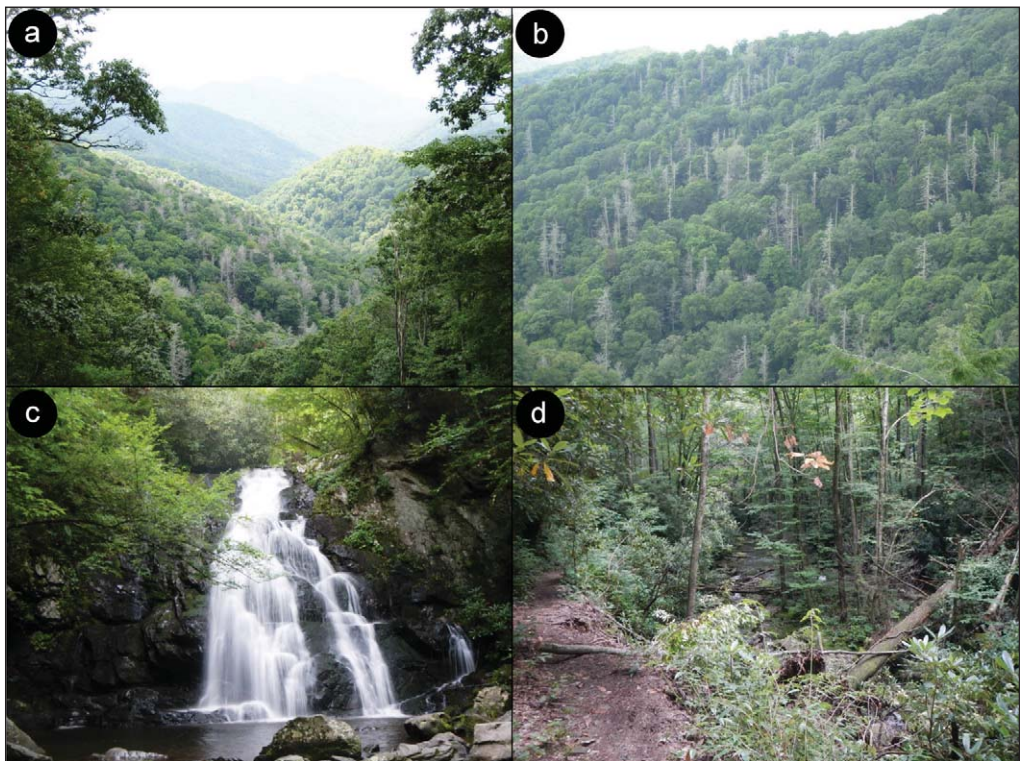
Figure. 1. a, b. View of mixed-species hillslope forest from afar and closer up with dead Eastern Hemlock (the gray dead trees) in Great Smoky Mountains National Park. Photo by S.R. Abella, 22 August 2013, along Highway 441 at 1200 m elevation near 35°35'44.9"N, 83°24'46.6"W (World Geodetic System 1984). c. Example of a typical site treated for Hemlock Woolly Adelgid within Great Smoky Mountains National Park to maintain Eastern Hemlock along riparian areas (photo by S.R. Abella, 21 August 2013). d. Trail damage from the death and toppling of an Eastern Hemlock, now lying across a stream in the bottom right of the photograph. Photo by S.R. Abella, 22 August 2013, near the Big East Fork Trailhead (Shining Rock Wilderness, Pisgah National Forest, NC), 1200 m elevation near 35°21'32"N, 82°49'43"W.

Because of its evergreen foliage and high crown-bulk density, Eastern Hemlock creates a unique microclimate that moderates conditions throughout the year. In summer, its foliage creates a dark, cool, moist microclimate below its canopy that has important implications for habitat and watershed functions. In the southern Appalachian Mountains of North Carolina for example, Webster et al. (2012) found that a doubling of per hectare Eastern Hemlock foliage mass resulted in a 15% decrease in mean summer temperature. During winter, Eastern Hemlock can ameliorate extreme temperatures and snowfall. In Vermont, Lishawa et al. (2007)