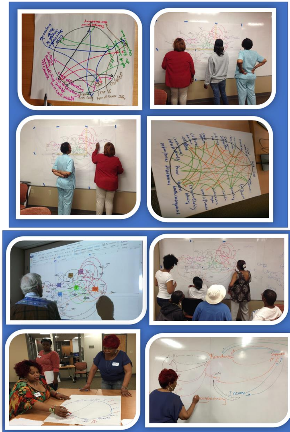
Figure 1. GMB workshops with community support and community member groups

and fewer health priorities. This will lead to lack of motivation/interest for early diagnosis, and fear resulting in denial about cancer, and isolation (decrease social support). All of these will create