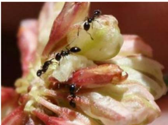
Figure 2. Ants tend a late instar Euphilotes enoptes larva. The larva’s head is oriented into the center of the inflorescence and an ant positions itself so that its mandibles hover above the dorsal nectary organ.