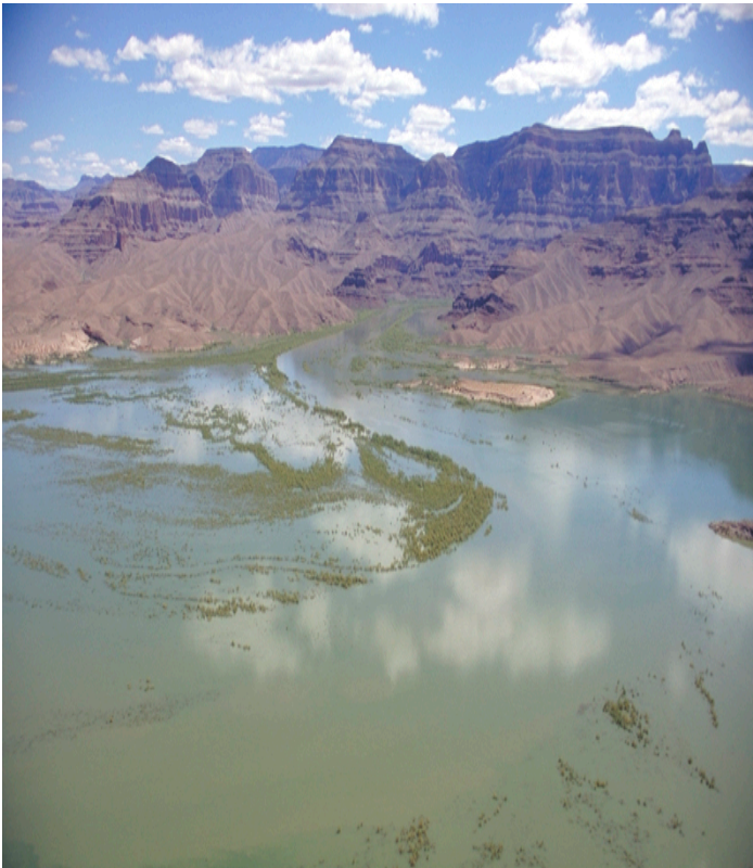
Lake Mead 1999