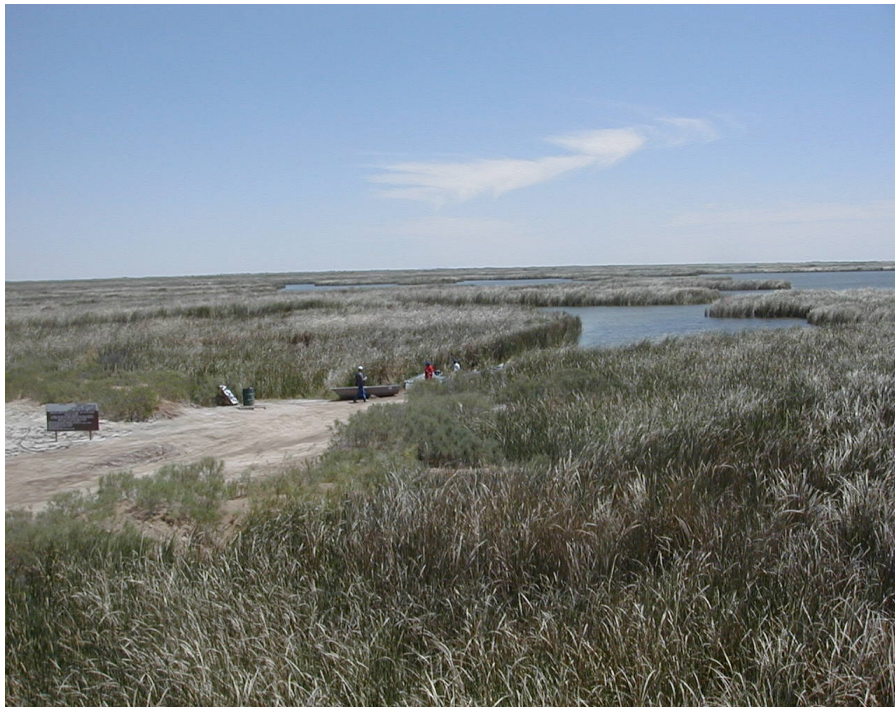
Santa Clara Wetland