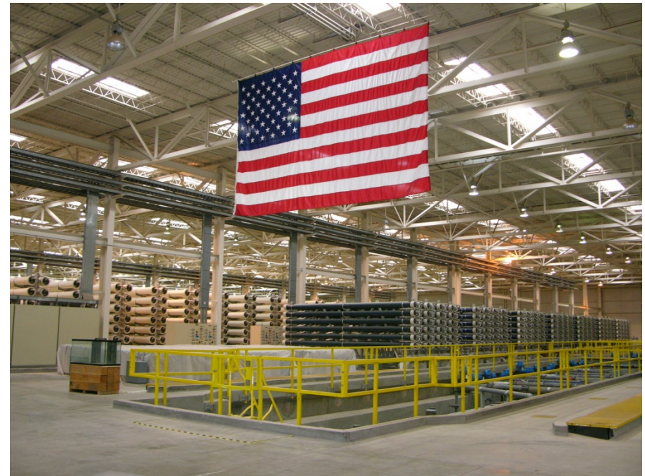
Yuma Desalting Plant