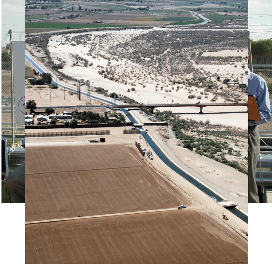
Colorado River at SIB