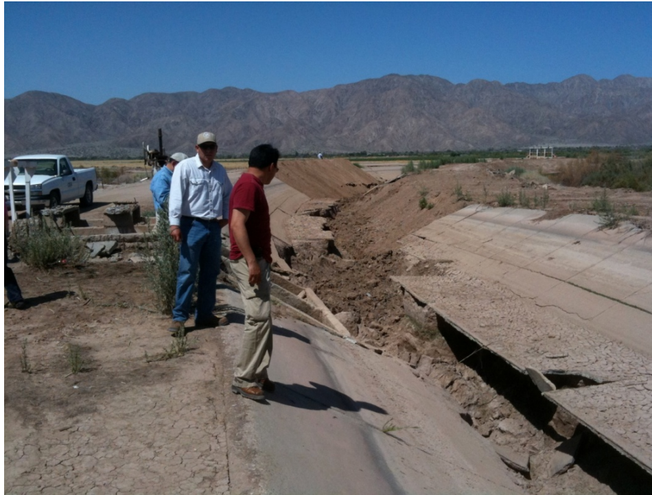
Damaged canal in Mexicali Valley