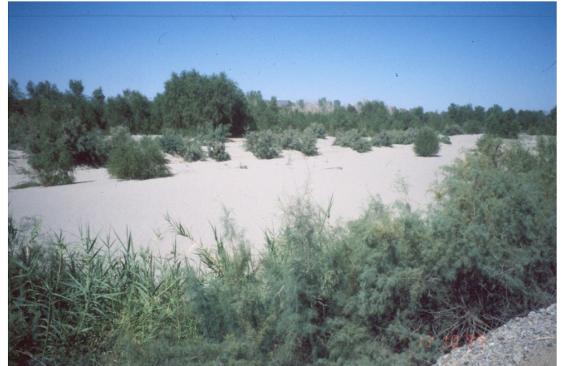
Sediment in Colorado River (1999)