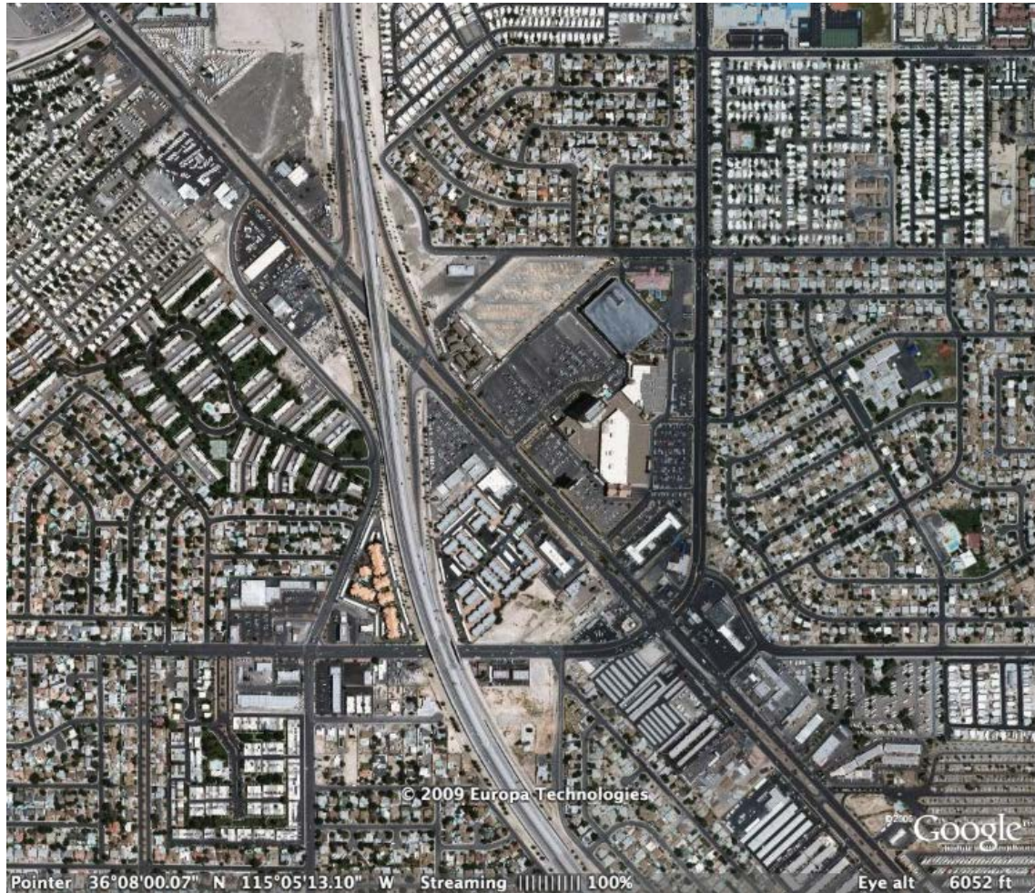
Figure 2: Google Earth image showing Boulder Station surrounded largely by residential neighborhoods. This confirms the origin of the moniker “neighborhood casino.”

purpose arena, the Fiesta has an ice rink, and a number of other properties offer lavish spas to their guests. The large size and seemingly all-encompassing set of entertainment amenities contributes to the edge-city character that I described above and makes the locals casino a hub of gaming as well as entertainment to the surrounding neighborhood.