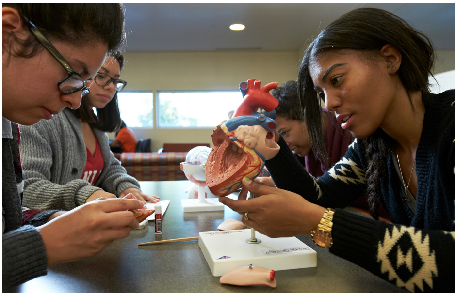
Students work with anatomical models at UNLV's Lied Library.

UNLV's School of Medicine has generated a lot of excitement—and rightfully so. The impact of such an investment will reach well beyond campus, transforming the local economy and rehabilitating the state's ailing health care system.