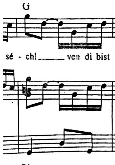
FIGURE 10. SHOLOM SECUNDA'S "BAI MIR BISTU SHEYN," M. 18. 35

In the measure posted in Figure 10, the singer would be unwise to make the leap of a fifth up to the G, onsetting on [x], and then sustaining [l] through the leap back down to the D. It would be vocally easier and more beautiful to insert and sustain a schwa.