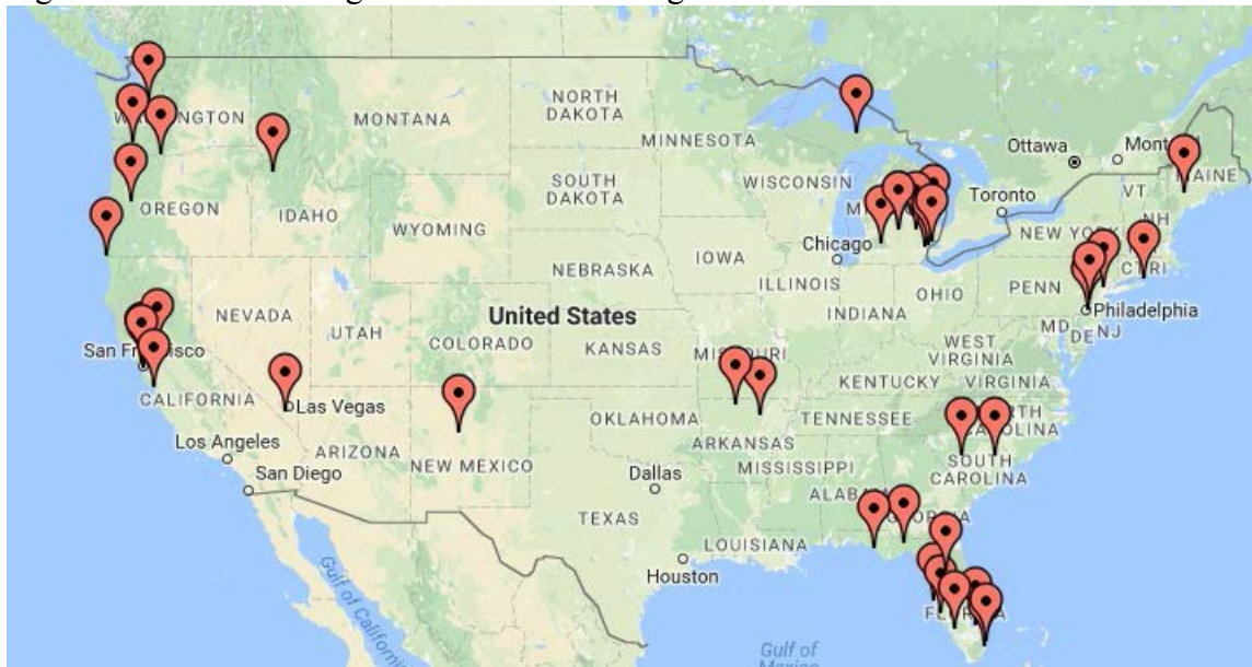
Figure 1. Location of High School Gardens Programs Across the United States