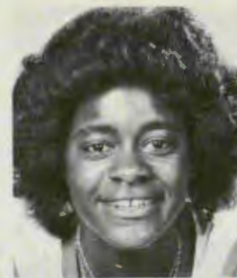
SENIOR GUARD BAKERSFIELD, CA 5-7