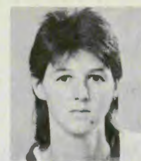
SENIOR FORWARD COVINA, CA 5-11