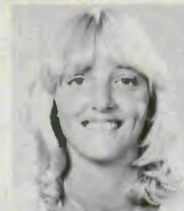
JUNIOR FORWARD LAS VEGAS, NV 5-10