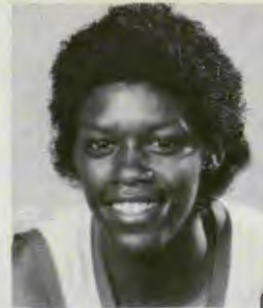
FRESHMAN GUARD BIRMINGHAM, AL 5-9