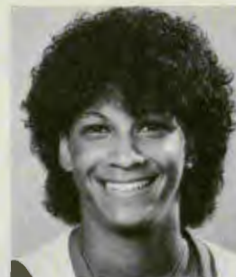
JUNIOR GUARD LAS VEGAS, NV 5-3½