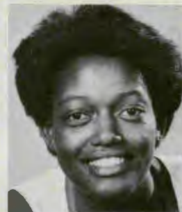
FRESHMAN GUARD ONTARIO, CA 5-10