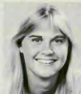
SOPHOMORE GUARD WINDSOR, ONTARIO, CANADA 5-11