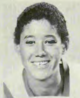
SOPHOMORE FORWARD SEATTLE, WA 6-1