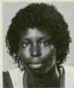
FRESHMAN FORWARD LYNWOOD, CA 6-2