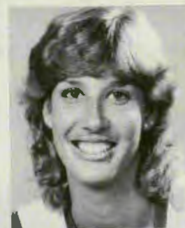
SOPHOMORE CENTER FARMINGTON HILLS, MI 6-4