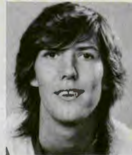
SOPHOMORE CENTER TUCSON, AZ 6-4