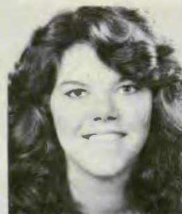
SOPHOMORE CENTER POUGHQUAG, NY 6-5