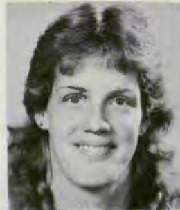
SENIOR FORWARD-CENTER PITTSBURGH, PA 6-1